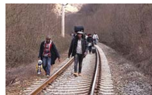
WEST AFRICAN MIGRANTS WALK ON TRAIN TRACKS ON THEIR WAY TOWARDS THE BORDER WITH MACEDONIA NEAR EVZONOI, GREECE, IN 2015.

“ African/EU migration has also been a result of greater economic opportunities and the pursuit of a better life by African migrants. ”