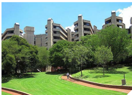
From left, the University of the West Indies, Cave Hill Campus, Barbados; and the University of Johannesburg, Auckland Park Kingsway Campus.