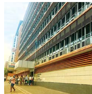
THE EXTERIOR OF THE SOUTH AFRICAN DEPARTMENT OF HIGHER EDUCATION AND TRAINING BUILDING IN TSHWANE, SOUTH AFRICA.

“ Humanities curricula remain largely untransformed and detached from the lived experiences of most South Africans 25 years into the post-apartheid era.”